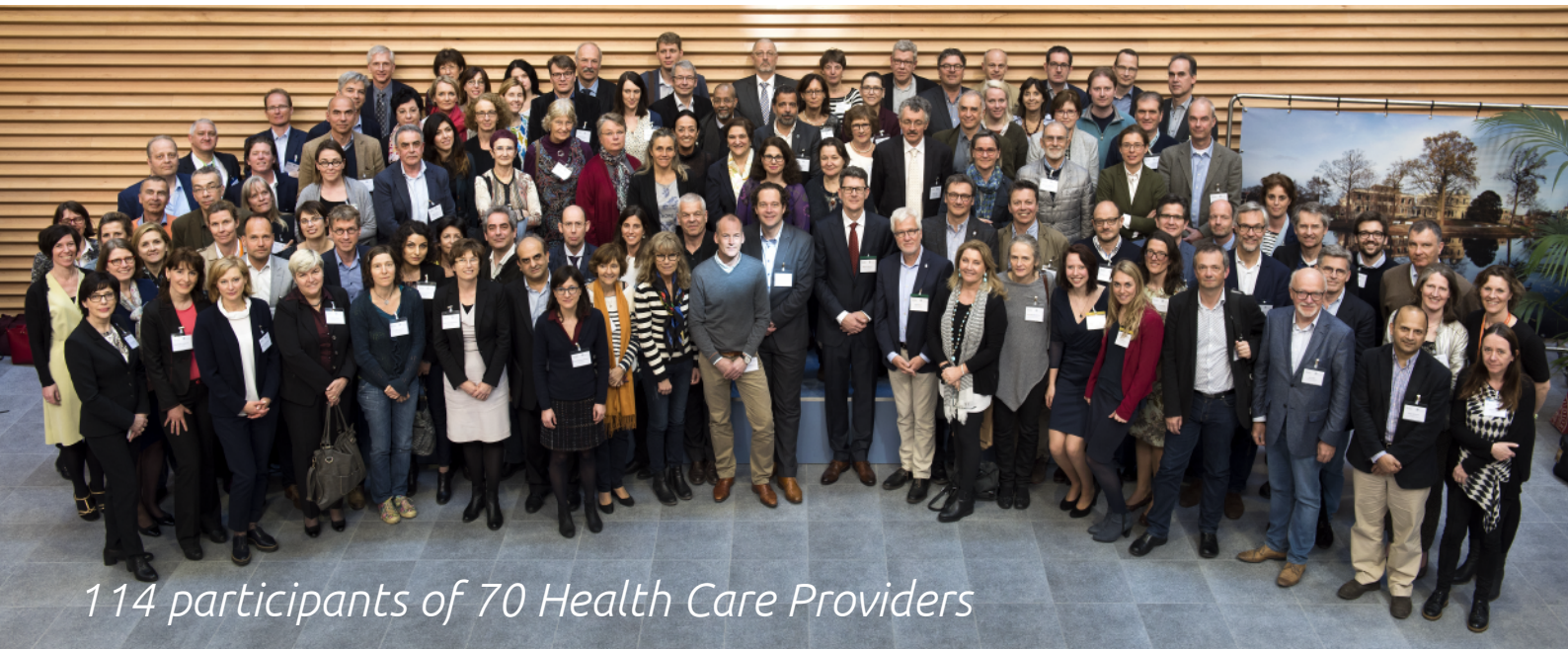
114 participants of 70 Health Care Providers

The European Reference Networks for rare and complex diseases (ERNs) were officially installed on 9 March 2017 at the 3rd conference on Rare diseases in Vilnius, Lithuania. The first General Assembly (GA) of the European Reference Network on Rare Endocrine Conditions (Endo-ERN) was held on Monday 27 March 2017, in Leiden, The Netherlands. The purpose of this first annual meeting was first to inform and update all members and other stakeholders on the mission, structure, and governance of Endo-ERN, and subsequently to approve the current application by the members via voting in order to be officially operational, and finally to attain contribution of each Health Care Provider (HCP) to the pre-defined deliverables, as specified in the grant application.